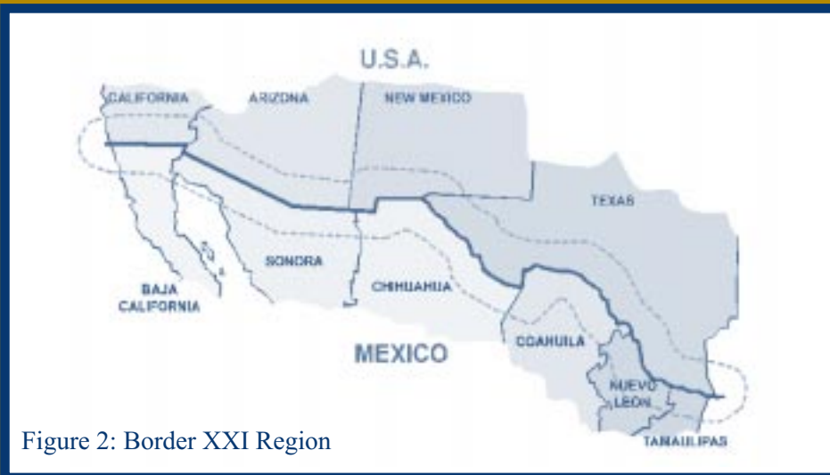
Figure 2: Border XXI Region

Other key participants include the U.S. Department of State (DOS); the U.S. National Oceanic and Atmospheric Administration (NOAA); the U.S. Agency for International Development (AID); the U.S. Department of Justice (DOJ); the U.S. Department of Transportation (DOT); the U.S. Department of Energy (DOE); Mexico's Secretariat of Foreign Relations (SRE); Mexico's National Institute for Statistics, Geography, and Information (INEGI); Mexico's Secretariat of Interior (Civil Protection); Mexico's Secretariat of Communication and Transportation (SCT); and Mexico's Secretariat of Energy (SE).