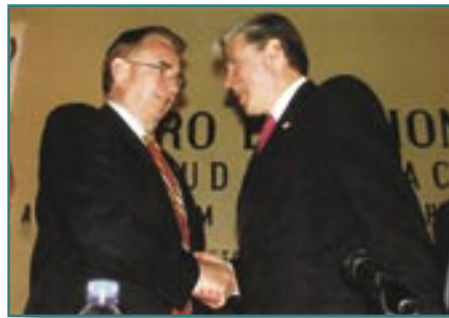
Commissioners Tommy G. Thompson (left) and Julio Frenk Mora (right) at the USMBHC's 5th Annual Meeting.

As Health and Human Services Secretary, Thompson was the nation's leading advocate for health and welfare. During his tenure, Thompson launched major initiatives to strengthen the nation's preparedness for bioterrorism attacks, increased the funding for the National Institutes of Health, reorganized Medicare and Medicaid services to encourage greater responsiveness and efficiency, and focused attention on disease prevention in critical health areas, such as obesity, diabetes and health disparities.