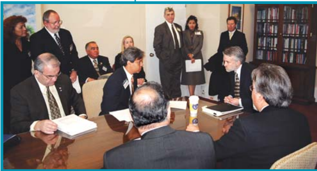
Commission members and members of the American Medical Association at the Border Health Caucus meeting held in Washington, D.C.

The steering committee will have another meeting on June 7 in El Paso, Texas.