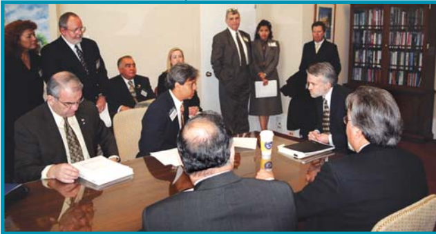
Commission members and members of the American Medical Association at the Border Health Caucus meeting held in Washington, D.C.

The steering committee will have another meeting on June 7 in El Paso, Texas.