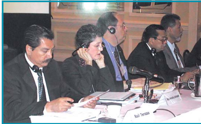
Commission members at the 9th binational meeting held in El Paso.

The Commission held its 9 th binational meeting on April 23 in El Paso, Texas. Members in attendance discussed several matters of importance to the USMBHC.