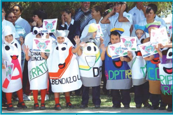
Children from El Paso's Head Start Program joined children from Ciudad Juárez in celebrating the kick off of Mexico's second Immunization Week.