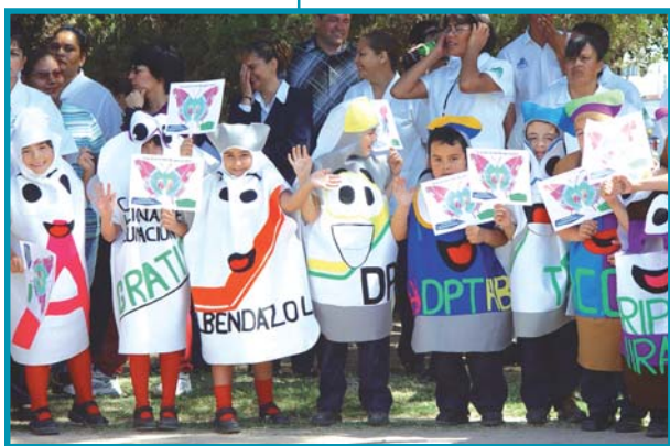
Children from El Paso's Head Start Program joined children from Ciudad Juárez in celebrating the kick off of Mexico's second Immunization Week.