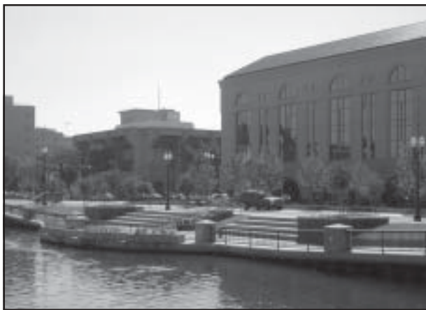
The parking lot was reborn as a pedestrian plaza.

area on the North Shore and two to three acres on the South Shore. More than $100 million in private and public investment has resulted in the first increase in property values for existing building in the past ten years.