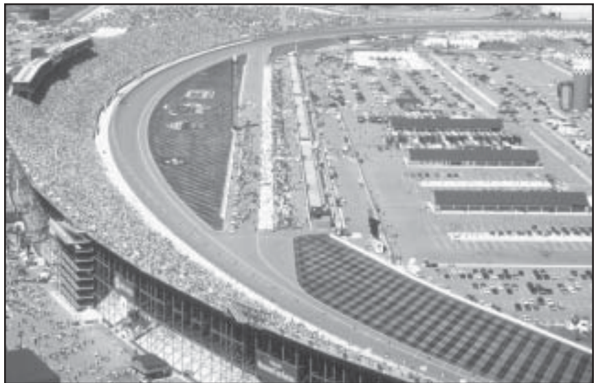
Before its redevelopment, the Kaiser Steel Mill site, located 50 miles east of Los Angeles, was an industrial wasteland littered with thousands of tires and idled blast furnaces.

ronmental cap constructed and the land was ready for reuse -- record time for a site of this size and complexity. The Inaugural Race of the California Speedway was held June 22, 1997. The California Speedway, is the largest sports venue in Southern California and hosts the NASCAR Winston Cup California 500 in addition to other sporting events.