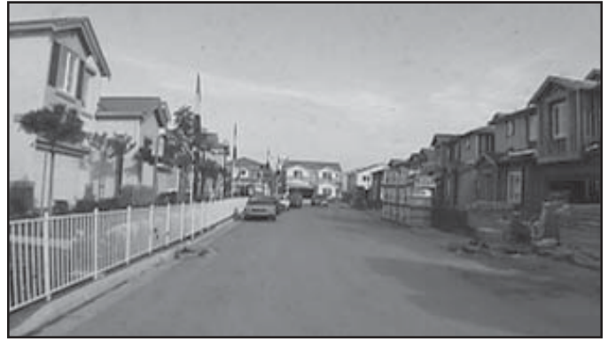
Heron Bay now offers homes for 600 Bay Area families, as well as habitat for other species.

In March 1994, the developer, Heron Bay, signed a Voluntary Cleanup Agreement to ensure that remedial work was conducted in an environmentally safe manner. A Removal Action Workplan was developed, approved and implemented in the summer of 1995. As part of the plan, 400 acres were redeveloped into permanent open space and wildlife habitats. A major feature of this property is the salt marsh that has been re-