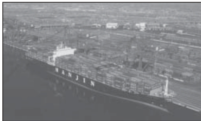
Hanjin Shipping Company is one of many cargo shippers at the Port of Long Beach.

With DTSC oversight and involvement, nearly 500,000 cubic yards of contaminated soil was excavated, treated and stabilized. Rather than transport the soil to an offsite hazardous waste facility, which would have cost more than $200 million, DTSC and others involved