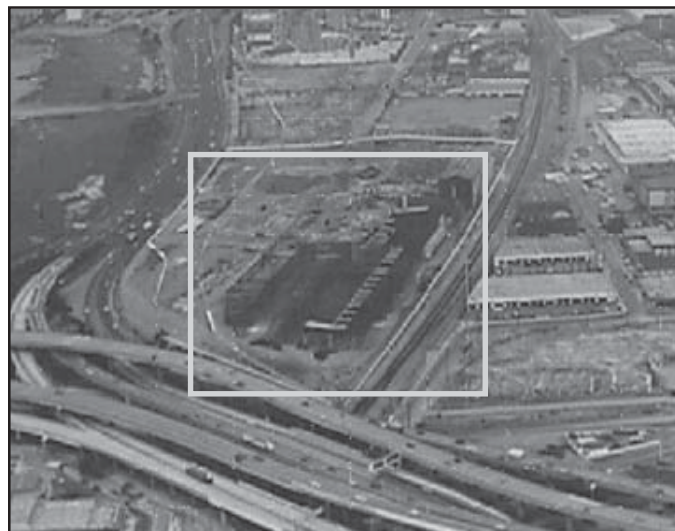
The Barbary Coast Steel Mill property sat unused in a prime location near the San Francisco Bay.

DTSC entered into a Prospective Purchaser Agreement (PPA) and Covenant Not to Sue with IKEA in late 1997 which was a key factor in the redevelopment project. The PPA covers the former Barbary Coast Steel Plant site, a steel manufacturing plant that operated from 1882 to until approximately 1991. The previous owner, Barbary Coast Steel Corporation, conducted substantial cleanup activities in 1996 and 1997 under an approved Remedial Action Plan. These activities included: demolition of buildings, site-wide removal of at least two feet of soil contaminated with petroleum hydrocarbons, metals, pesticides, polychlorinated biphenyls (PCBs), volatile organic compounds and semi-volatile