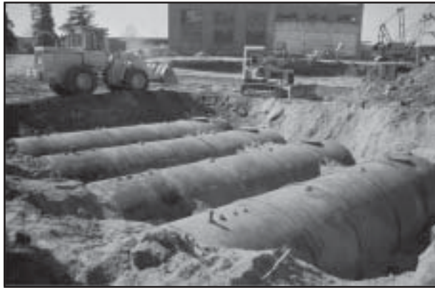
The Federal Courthouse is the largest construction project in the City of Sacramento's history.

The three-acre Federal Courthouse site is composed of a half-acre area known as "The Sacramento Station Study Area," Southern Pacific Rail Yard Site, and approximately 2.5 acres of City of Sacramento property. The City of Sacramento property was used as a fueling, maintenance and parking facility for the Police Department. Under the VCP, the City of Sacramento remediated petroleum hydrocarbon, motor oil and antifreeze soil contamination during the excavation for the building's underground parking garage. Groundbreaking for the Federal Courthouse began in August 1995 for the $142 million, 380,000 square-foot building that will produce more than 1,000 new construction jobs and 200 permanent jobs.