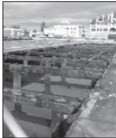
A parking deck over the Stockton Channel.

The first step was to conduct a Preliminary Endangerment Assessment on the property to identify the type and concentrations of contami-